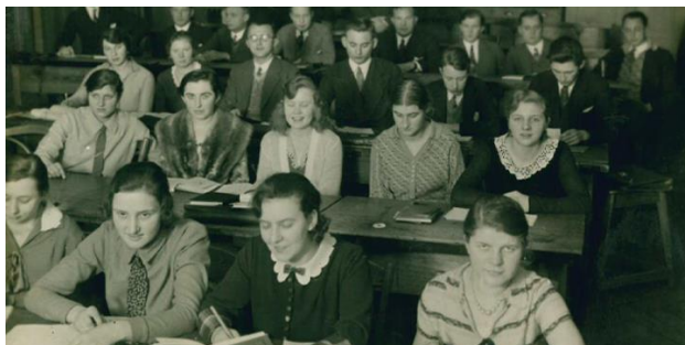
Languages, Geometry, Critical Thinking and Goethe's Faust Course board at Volkshochschule Jena 1931