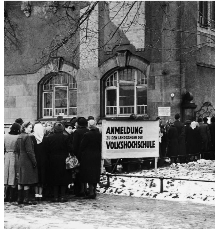
Konrad Haenisch minister of public (adult) education